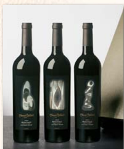
2003 WILL ROBINSON 90 POINTS – Wine Spectator 90 POINTS – Wine Advocate