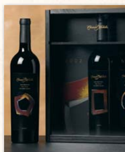
2002 GERARD TSUTAKAWA 91 POINTS – Connoisseurs' Guide to California Wine ★★★★ – Restaurant Wine