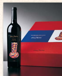
2001 RICHARD MARQUIS 91 POINTS – Wine Advocate