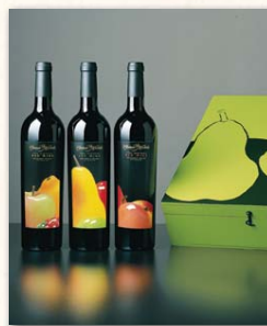
1998 FLORA C. MACE AND JOEY KIRKPATRICK 91 POINTS – Wine Spectator 91 POINTS – Wine Enthusiast