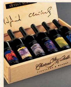
1993 DALE CHIHULY 93 POINTS – Wine Enthusiast