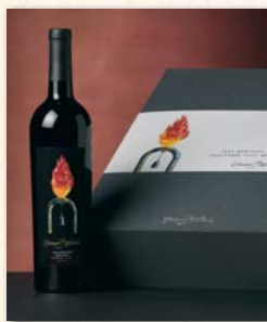
2000 ITALO SCANGA 90 POINTS – Wine Spectator