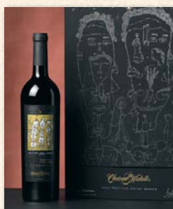
2004 ALDEN MASON 92 POINTS – Wine Advocate