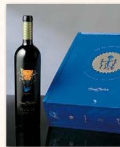
1997 DAN DAILEY 89 POINTS – Wine Spectator