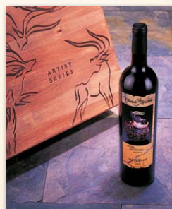
1994 WILLIAM MORRIS 91 POINTS – Wine Spectator 91 POINTS – Wine Enthusiast