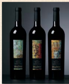
2006 EVA ISAKSEN 91 POINTS – Wine Advocate 91 POINTS – Wine Enthusiast

For more than a decade, Chateau Ste. Michelle's Artist Series Meritage red wine has celebrated the inspired collaboration between artisan winemaking and fine art. The wine is a Bordeaux-style blend crafted for power and longevity. Each variety contributes a special attribute to the blend, resulting in a complex wine with layers of aromas and flavors. Each Artist Series vintage features the work of renowned artist on the label, from blown glass to bronze sculptures to paint on canvas.