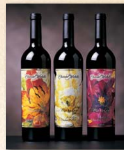
2005 BOBBIE BURGERS 92 POINTS – Wine Advocate